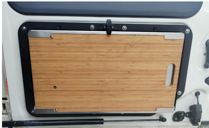
Fold away position