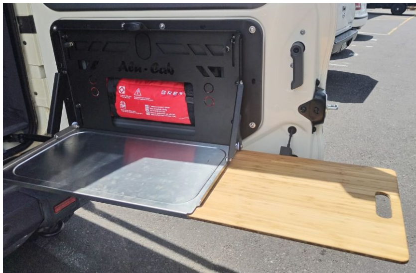
Cutting board extended